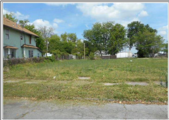
FRONT VIEW OF SUBJECT PROPERTY