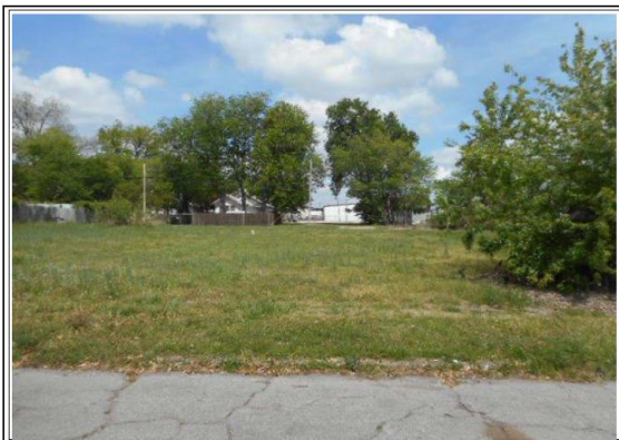
FRONT VIEW OF SUBJECT PROPERTY