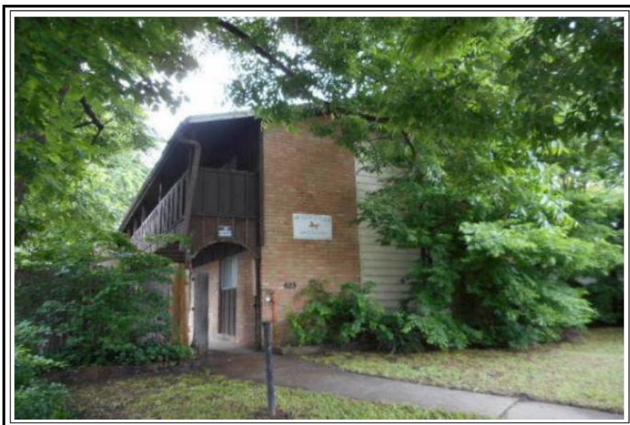
FRONT VIEW OF SUBJECT PROPERTY