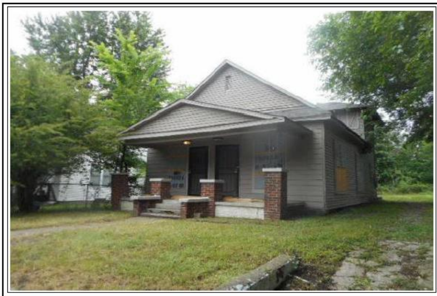
FRONT VIEW OF SUBJECT PROPERTY