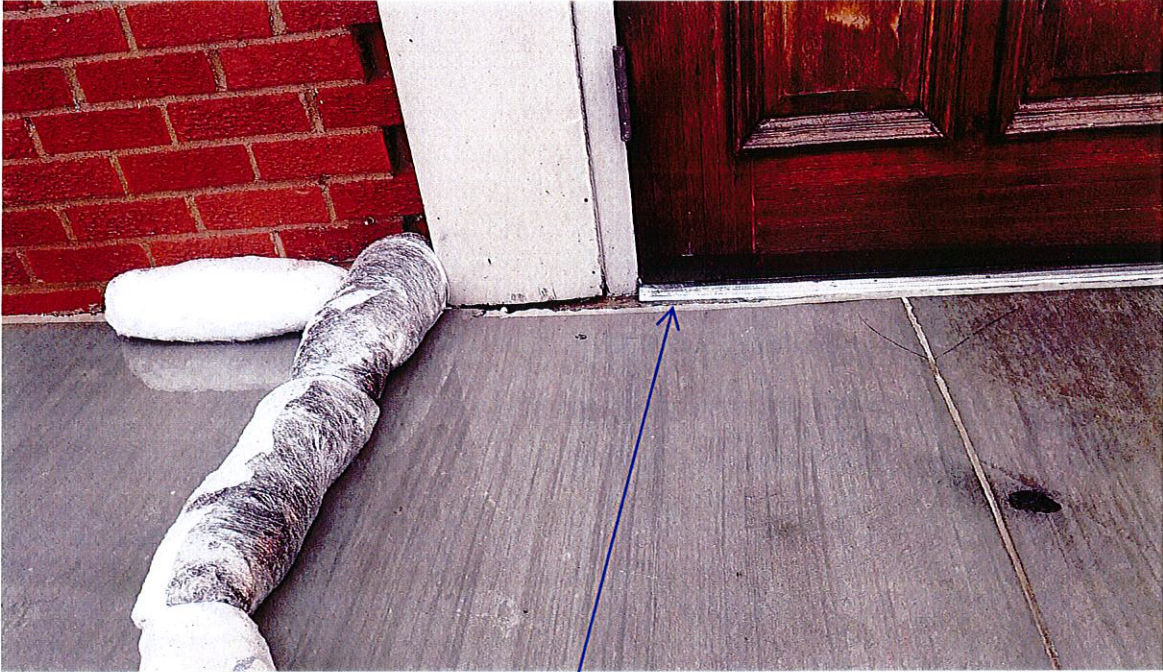
TAVERN - WATER INFILTRATION